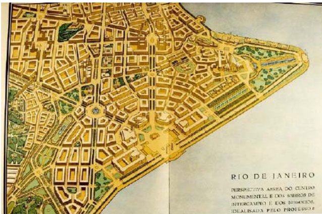
Alfred Agache 1930