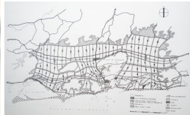
Constantino Doxiadis 1965