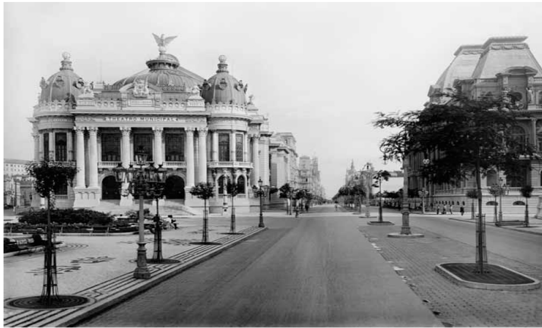
The Belle Epoque Carioca 1900s