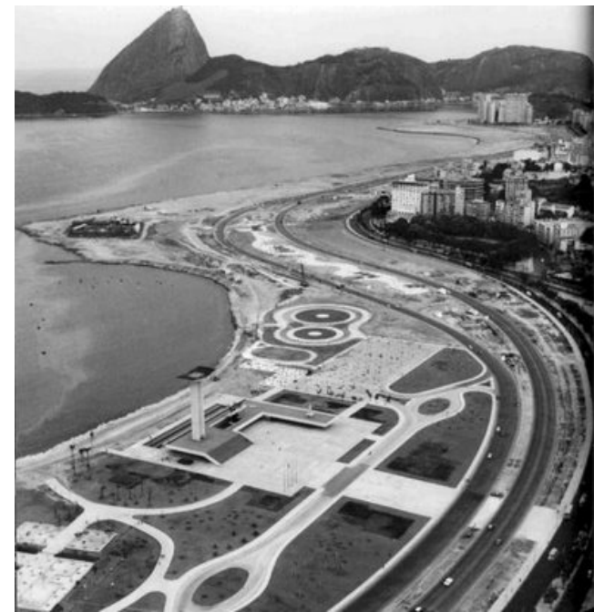
Flamengo Park 1960s