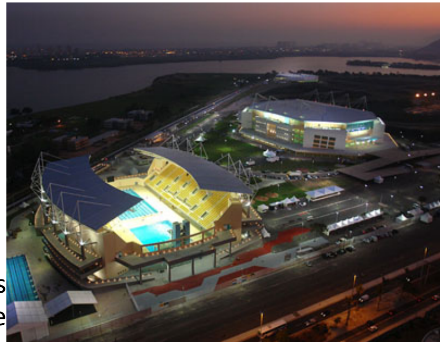
Aquatic centre, sports Arena and the velodrome