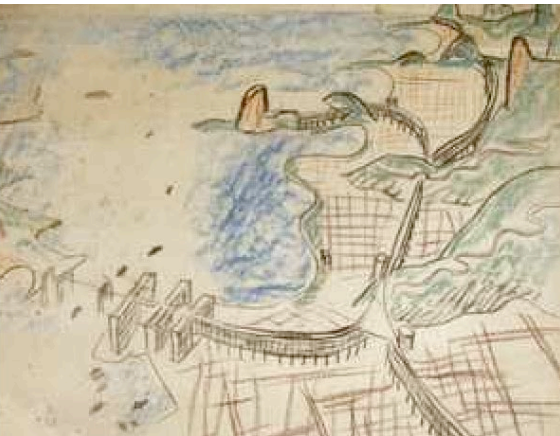
Le Corbusier 1929